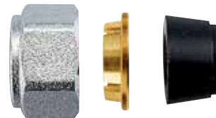
Raccordo a compressione per tubo rame monocono in gomma. Calotta filetto 24x19 cromata. Compression fitting connection for copper pipe. Rubber monocone and chromium-plated brass nut thread 24x19.